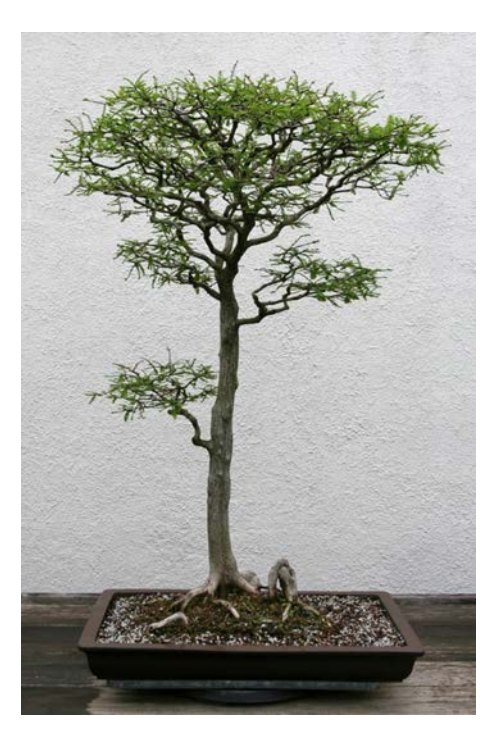
One of Vaughn Bantings' Flat-Top Cypress Mature "Graceful & Fluid" Variant Form