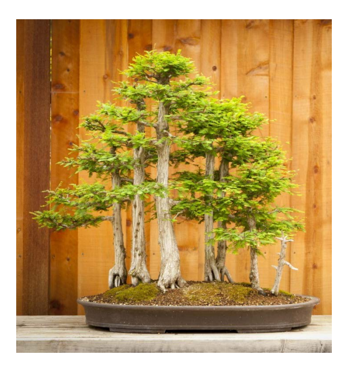
Bald Cypress as a forest planting Immature "Gradually Tapered" Typical Form

As you can see, they adapt very well to a variety of styles.