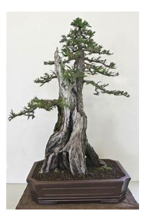
Bill Valavanis' Bald Cypress with extensive "shari" and hollow trunk Immature "Blunt & Fluted" Variant Form where the original trunk line was destroyed