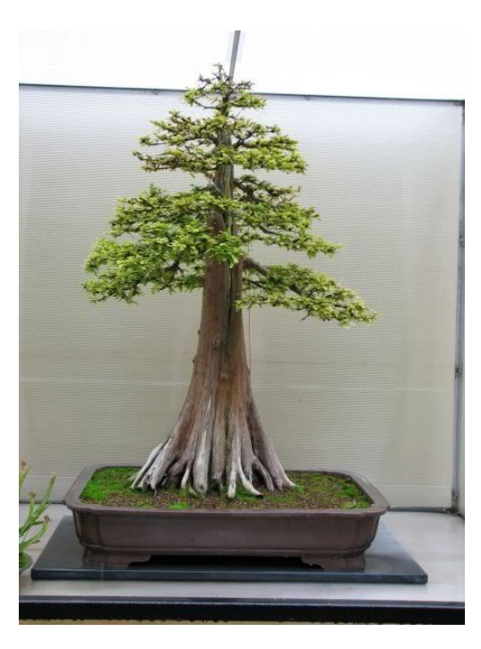
Immature "Blunt & Fluted" Variant Form