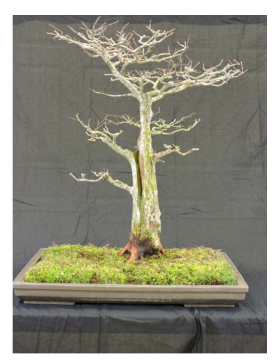
Jim Osbornes' Bald Cypress "flat-top" with hollow trunk Mature "Static &Stately" Form