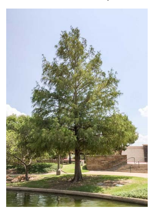
Formal Upright, immature cypress in the typical, gradually tapered form

In addition to the typical formal upright, immature form, it also exists as, what Vaughn referred to, as a "blunt and fluted variant". The blunt and fluted variant is a short, squat, formal upright cypress that has the buttressed and fluted base, typical of large cypress, but is very short. An excellent example of this can be seen in a small pond within the city limits of Alexandria, Louisiana, on Hwy 28. There are several bald cypress with massive, fluted bases, measuring four to six feet in diameter but only 10-15 feet tall. You will often see bonsai created after this type of variant to best illustrate the Formal Upright style. You can see several famous examples of this in some of the bonsai photos below.